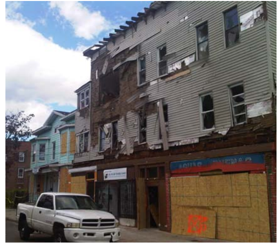
Damages to businesses and homes on East Main Street in Bridgeport, CT caused by the tornado.