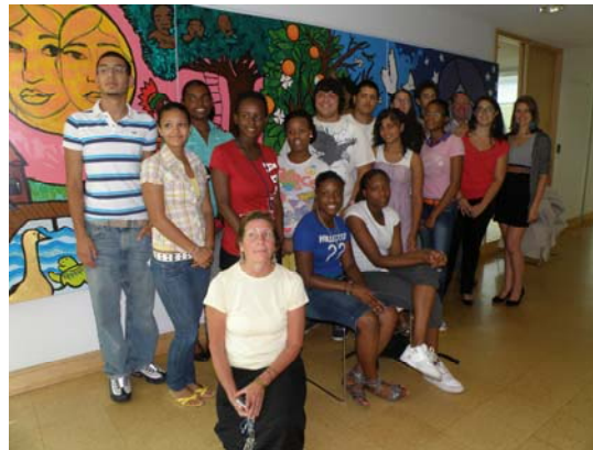
Participants of the 2010 Summer Youth Employment and Learning Program at Capital Workforce Partners.